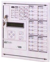
TH400-REP Repeater module